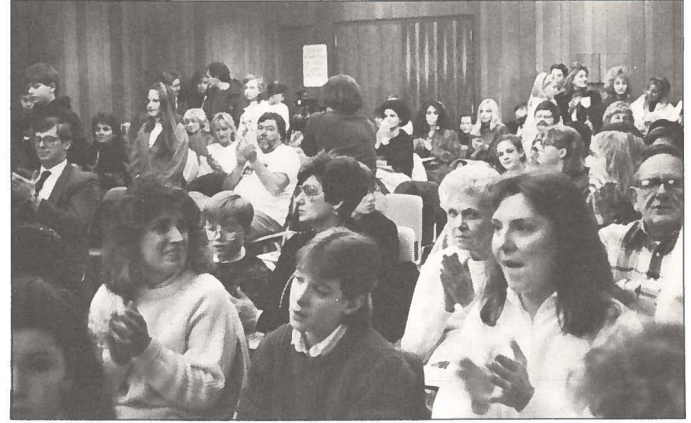
Participants in "The Write Stuff", our annual creative writing contest, were honored on Tuesday evening, January 23, at a reception in the Northport Library meeting room. Contest winners are: