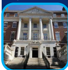
Museum of the City of New York