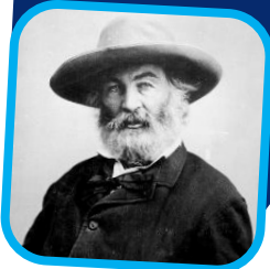
Walt Whitman Birthplace State Historic Site