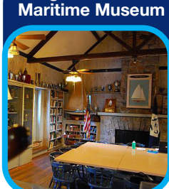
Long Island Maritime Museum