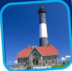
Fire Island Lighthouse Preservation Society