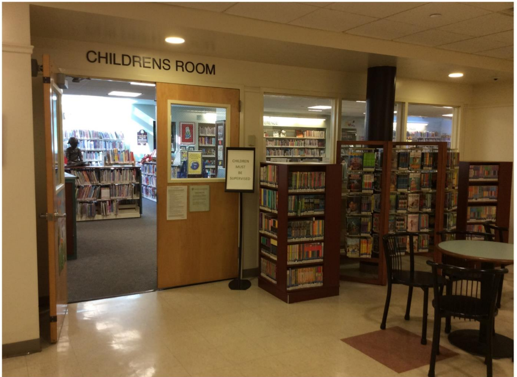
This is the Children's Room.