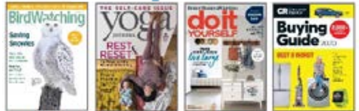
Bird Watching Yoga Journal Do It Yourself Consumer Reports

Flipster®, the next-gen digital newsstand, now offers content across all of your favorite devices. With access to top magazines combined with an easy to use interface, Flipster offers users a unique reading experience that can be enjoyed anytime, anywhere.