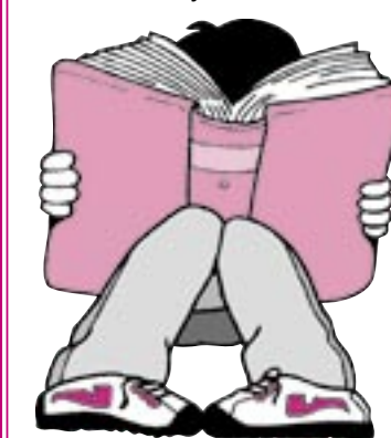
Adapted from an article by the Association for Library Service for Children, a division of the American Library Association.

Numerous studies have shown that summer programs help ensure that school children retain reading and learning skills over the summer recess. The summer reading programs at the Northport-East Northport Public Library are geared for reading just for the fun of it. If you can read, thank a teacher. If you love to read, thank a librarian. Our Library is in the business of creating a new generation of readers—people who are curious and love to read. Summer library programs take advantage of children's natural curiosity to introduce new subjects and different genres—things kids are interested in but might not study in school.