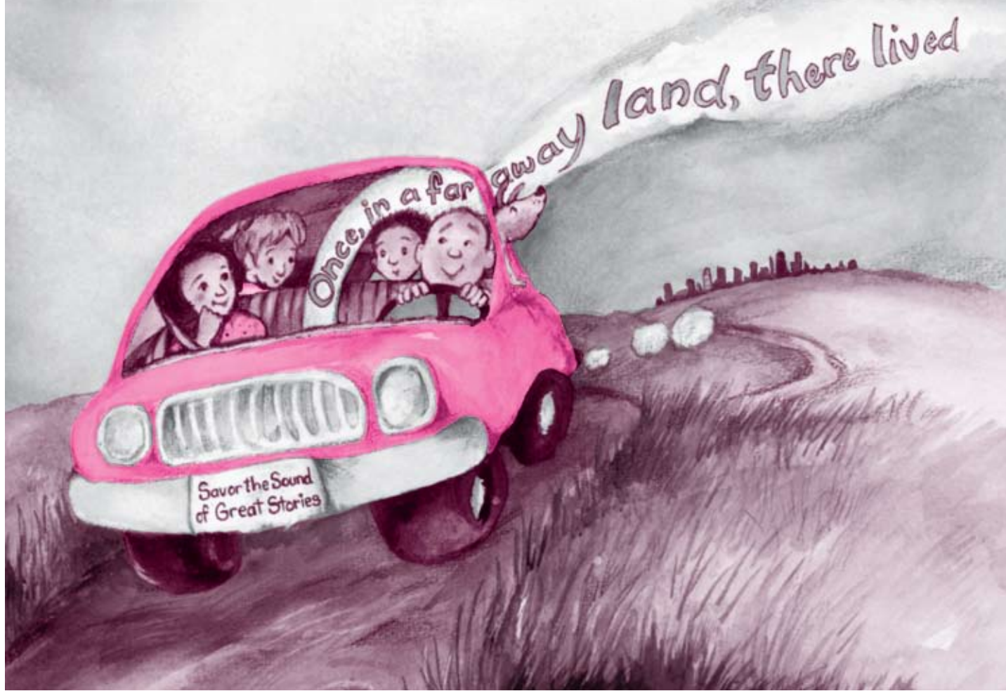
Cover art reprinted from a poster by Listening Library/Books on Tape, a division of Random House, Inc.

On your next summer adventure, don't forget to bring along the audiobooks!