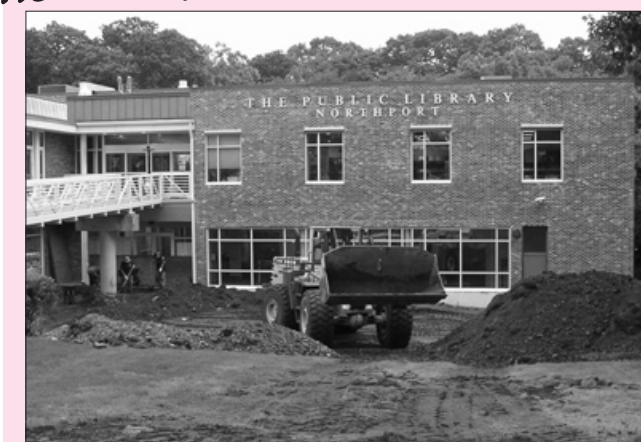
Thanks to generous community support, construction on the Northport Library's new courtyard began on August 11.