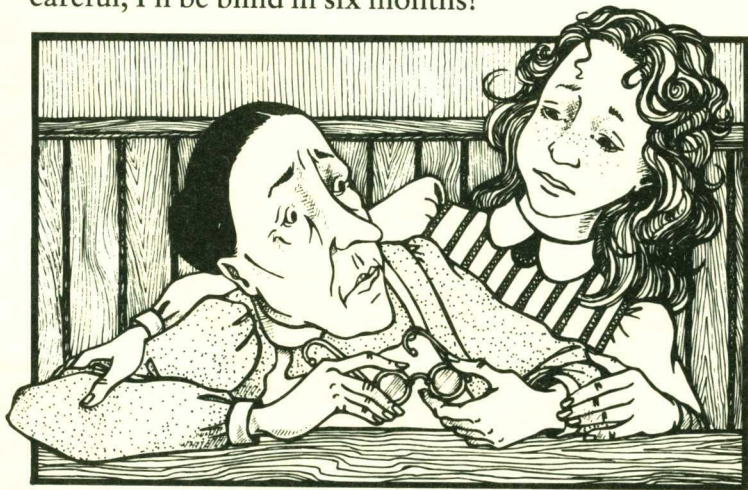
'I mustn't read or write, and I must wear glasses,' said Marilla.

'He says I mustn't read or write, and I must wear glasses. Then my head won't hurt. But if I'm not very careful, I'll be blind in six months!'