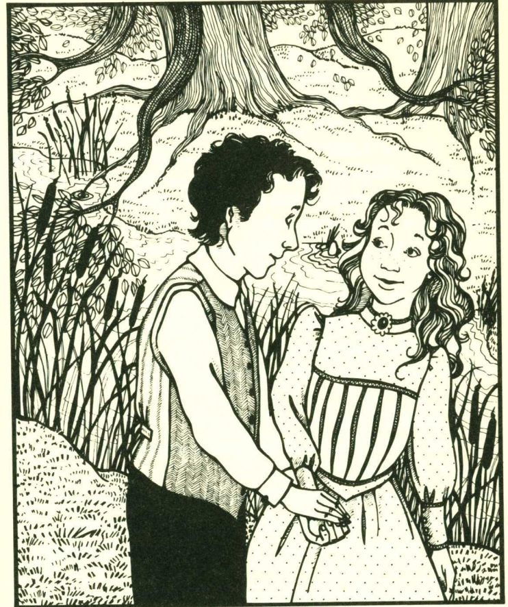
Gilbert smiled and held Anne's hand firmly.

'Yes,' replied Anne, her face red. 'Gilbert and I've