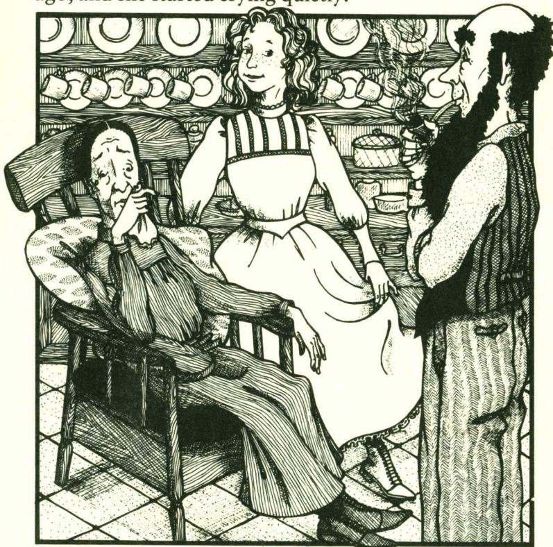
Anne put on one of her new dresses to show Matthew.

The evening before she left, she put on one of her new dresses to show Matthew. Marilla watched the happy young face. She remembered the strange, thin little child, with her sad eyes, who arrived at Green Gables five years ago, and she started crying quietly.