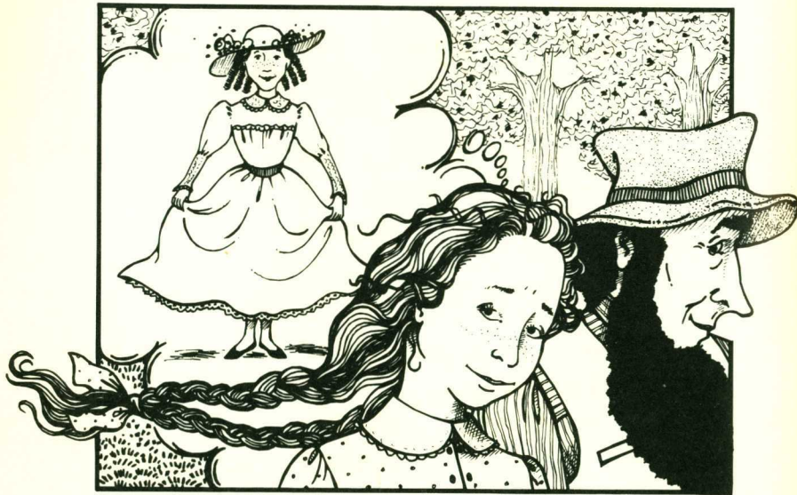
'I just imagine that I'm wearing the most beautiful blue dress.'

'Well, I . . . I . . . not often,' said Matthew.