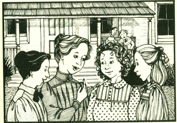
'Your Anne is a big girl now,' Rachel Lynde told Marilla.

'And look at her! Those beautiful grey eyes, and that red-brown hair! You know, Marilla, I thought you and Matthew made a mistake when you adopted her. But