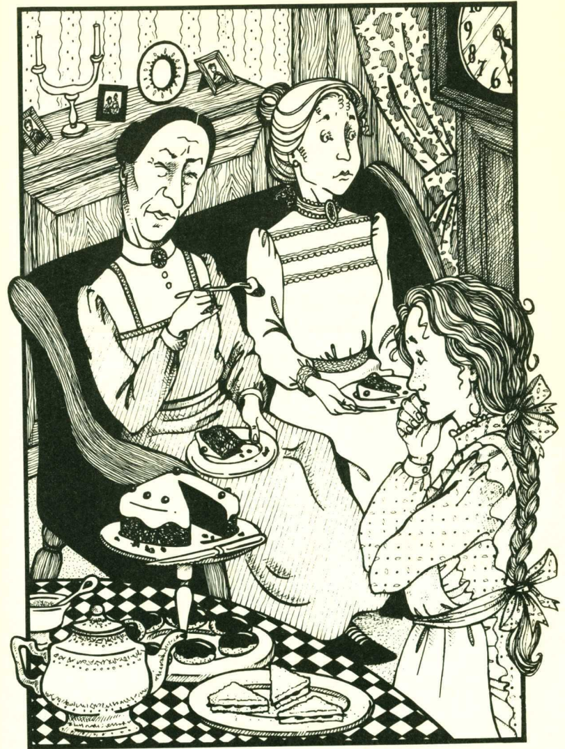
'Oh! Anne! What have you put in this cake?' Marilla cried.

'Isn't it . . . isn't it all right?' asked Anne, her face red.