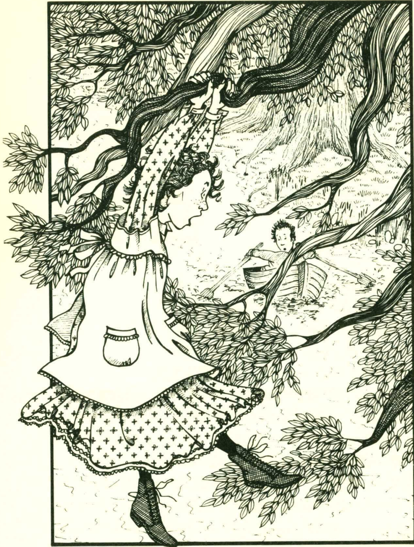
Suddenly, there was Gilbert Blythe in his boat!

into his boat. She didn't say a word. When they arrived at the bridge, she got out and turned away.