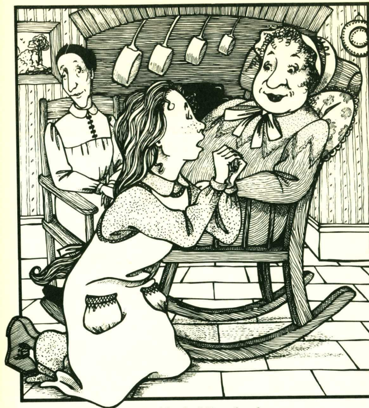
Anne suddenly fell on her knees.

'Oh Mrs Lynde,' cried the little girl, 'I'm very sorry. I can't tell you how sorry I am, so you must just imagine it. I am a bad girl! But please say you will forgive me. I'll be sad all my life if you don't!'