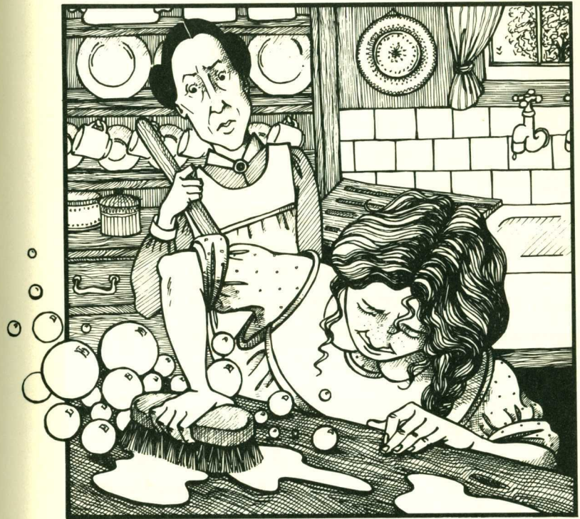
In the morning Anne helped Marilla with the housework.

When the two girls met, they knew at once that they would be good friends. They often played together, in the fields, or by the river, or in the garden. In the morning Anne helped Marilla with the housework. Then in the afternoon she played with Diana, or talked happily to Matthew while he worked on the farm. She soon knew and loved every flower, tree, and animal at Green Gables.