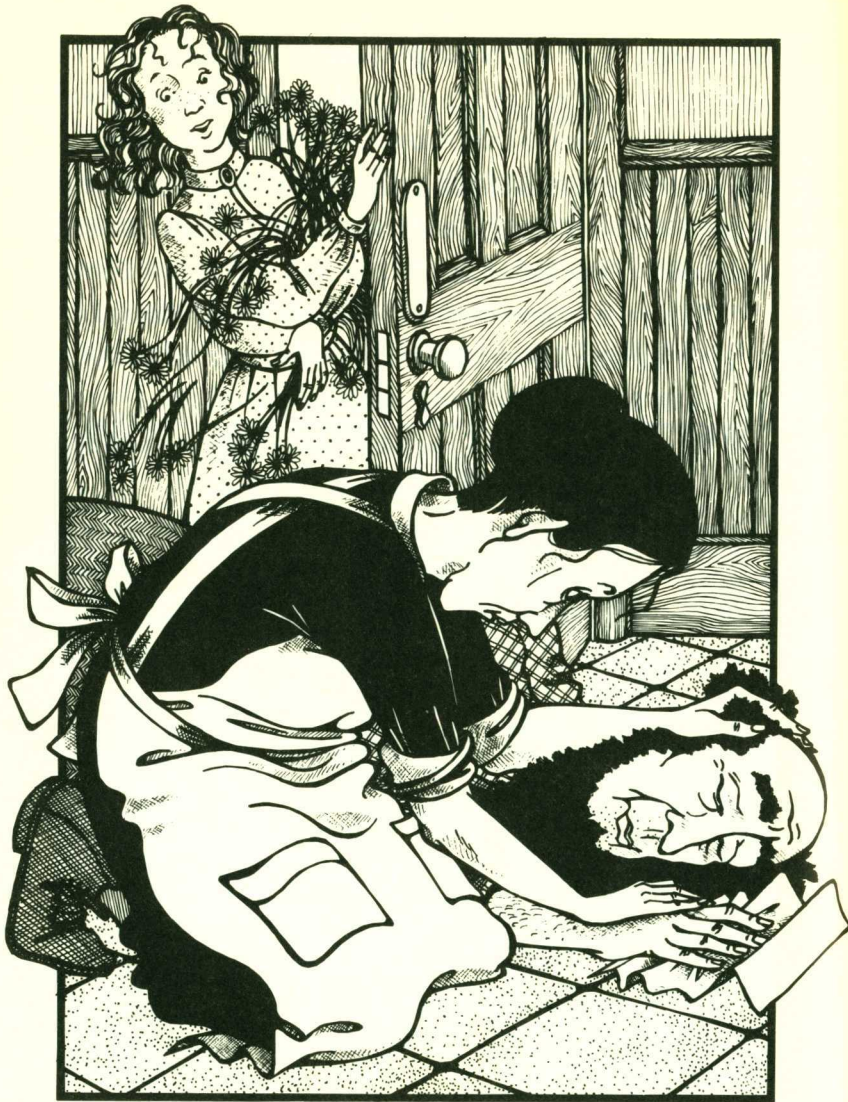
Anne dropped her flowers and ran to help Marilla.

later. 'Did he have any bad news suddenly?'