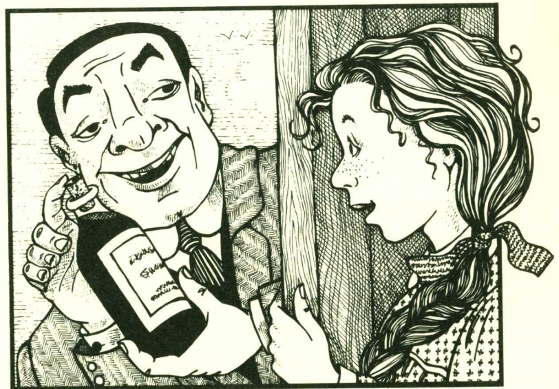
'I bought a bottle of something special from a man who came to the door.'

'I... I bought a bottle of something special from a man who came to the door. He said it would change my hair from red to black! Oh, I know it was stupid of me! But what shall I do?'