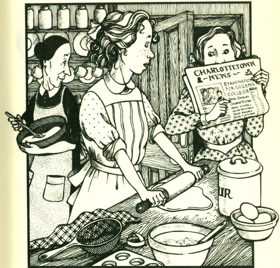
'Look, Anne! It's in Father's newspaper!' shouted Diana.

'You've done well, I must say, Anne,' said Marilla, who was secretly very pleased.