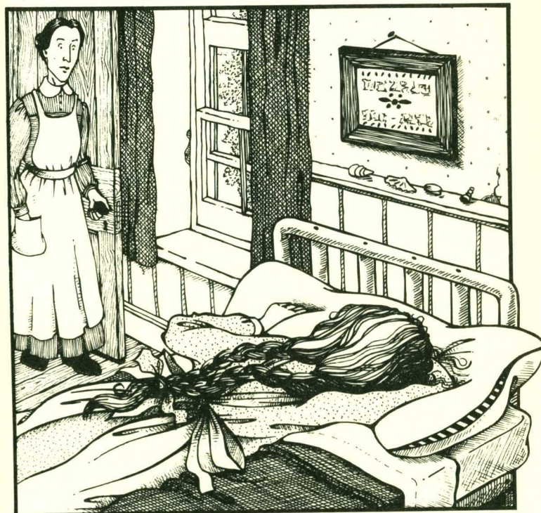
Anne was lying on her narrow bed, sobbing loudly.

'You mustn't get angry like that, Anne. Mrs Lynde is my friend, and you were very rude to her.'