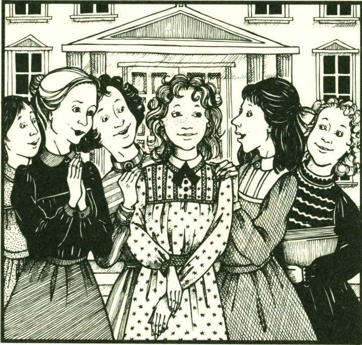
'Anne Shirley's got the Avery!'

'Matthew and Marilla will be pleased!' thought Anne. 'Now I can go on studying, and they won't have to pay!'