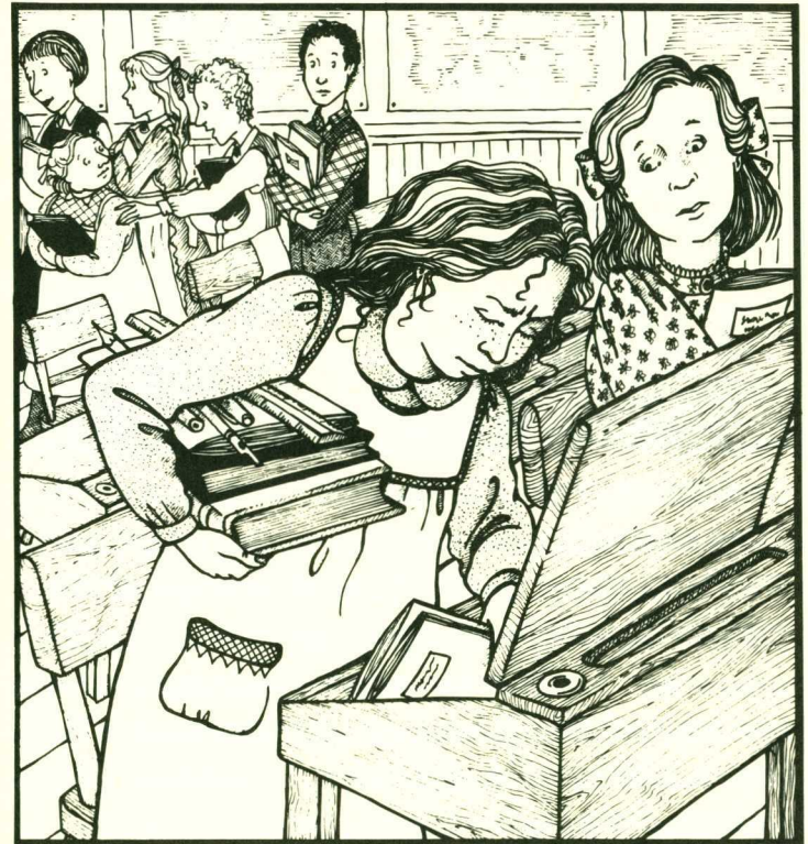
Anne took all her books, pens and pencils.

'What are you doing, Anne?' asked Diana.